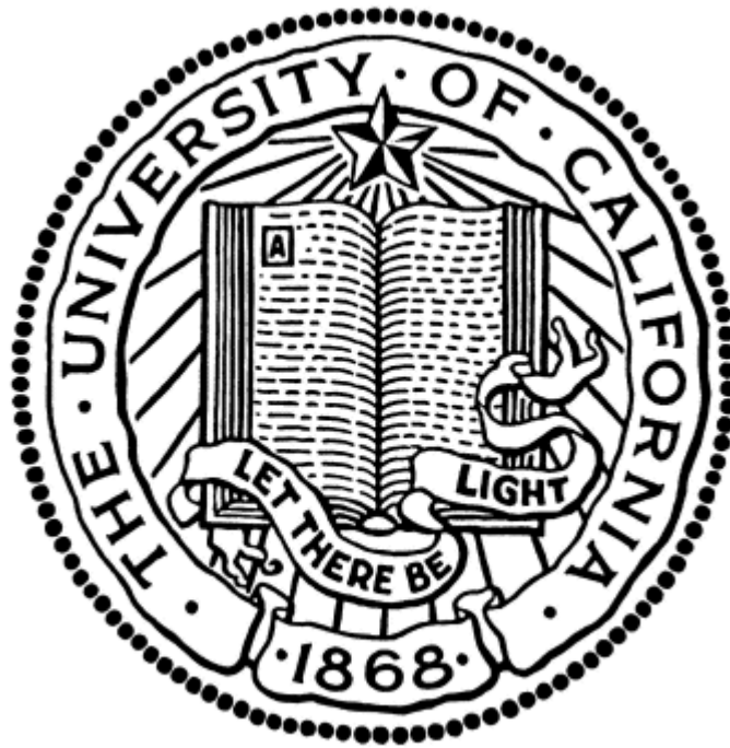
The "unofficial" seal of the University of California